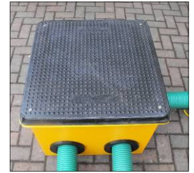
Electrical Draw Pits