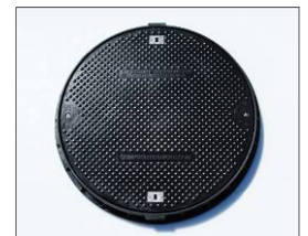
Forecourt Manhole Covers