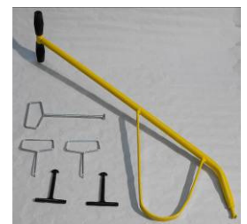
Covers Lift Sticks