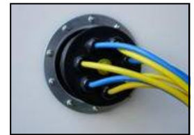
Pipe & Cable Entry Boots

Forecourt Solutions Composite Covers range of lightweight high strength manhole covers sees the arrival of its two newest covers. First to be introduced are a 900 mm circular and 750 mm square. These will shortly be joined by other sizes to enhance the range. Each cover within the range will feature our new HEX non-slip pattern and a range of security features to prevent theft from your underground infrastructure. Covers, frames and optional installation skirts will be made from composite high strength material to provide market leading functionality. These units will feature Forecourts unique DirtStop seal technology to prevent the ingress of dust and debris into the sealing face of the manhole cover and are further fitted with quality watertight compression seals. Particular attention has been given in the design process to eliminate the effect of "cover lock" due to temperature variation when frames are installed into large slabs of concrete without expansion joints.