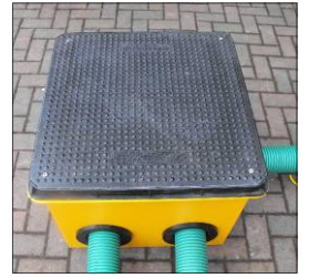
Electrical Draw Pits