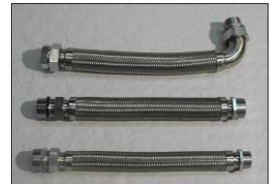
Flexible Hose Assemblies