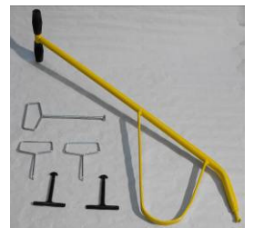
Covers Lift Sticks